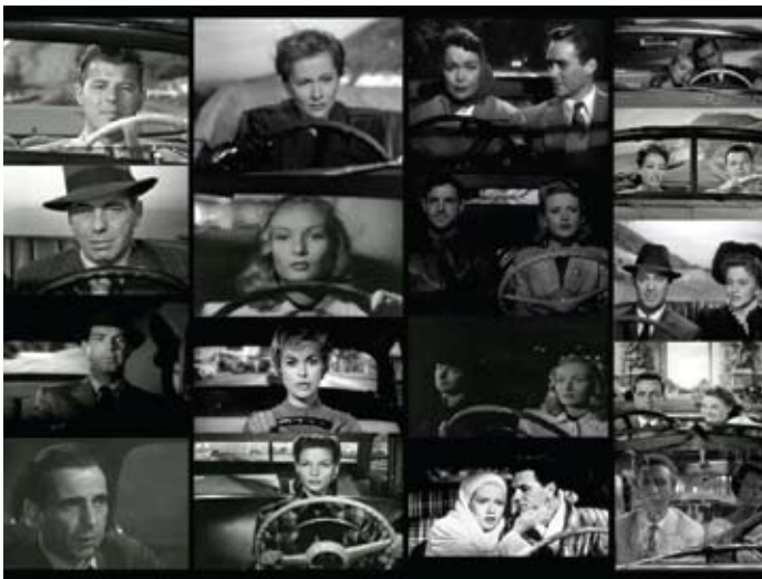
Acts of Will , 2007 Exhibition La puta de nuestras conciencias (in collaboration with Maj Britt Jensen) Installation view at Sala de Arte Público Siqueiros (Mexico City)