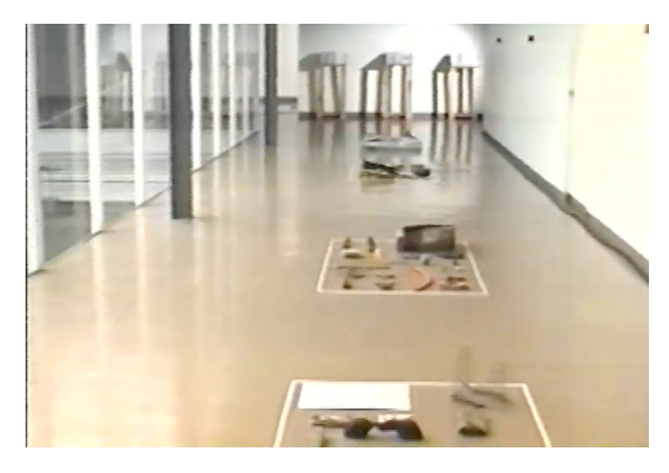
Raffael Rheinsberg. Recycling. The transformation of things, MACG, January 1992. Videocatalog of the exhibition 21'09"