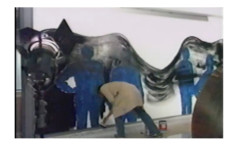
Felipe Ehrenberg. Pretérito imperfecto, MACG, November 1992. Videocatalog of the exhibition 23'34"

Néstor Quiñones. Aquietamiento, MACG, December 1993. Videocatalog of the exhibition